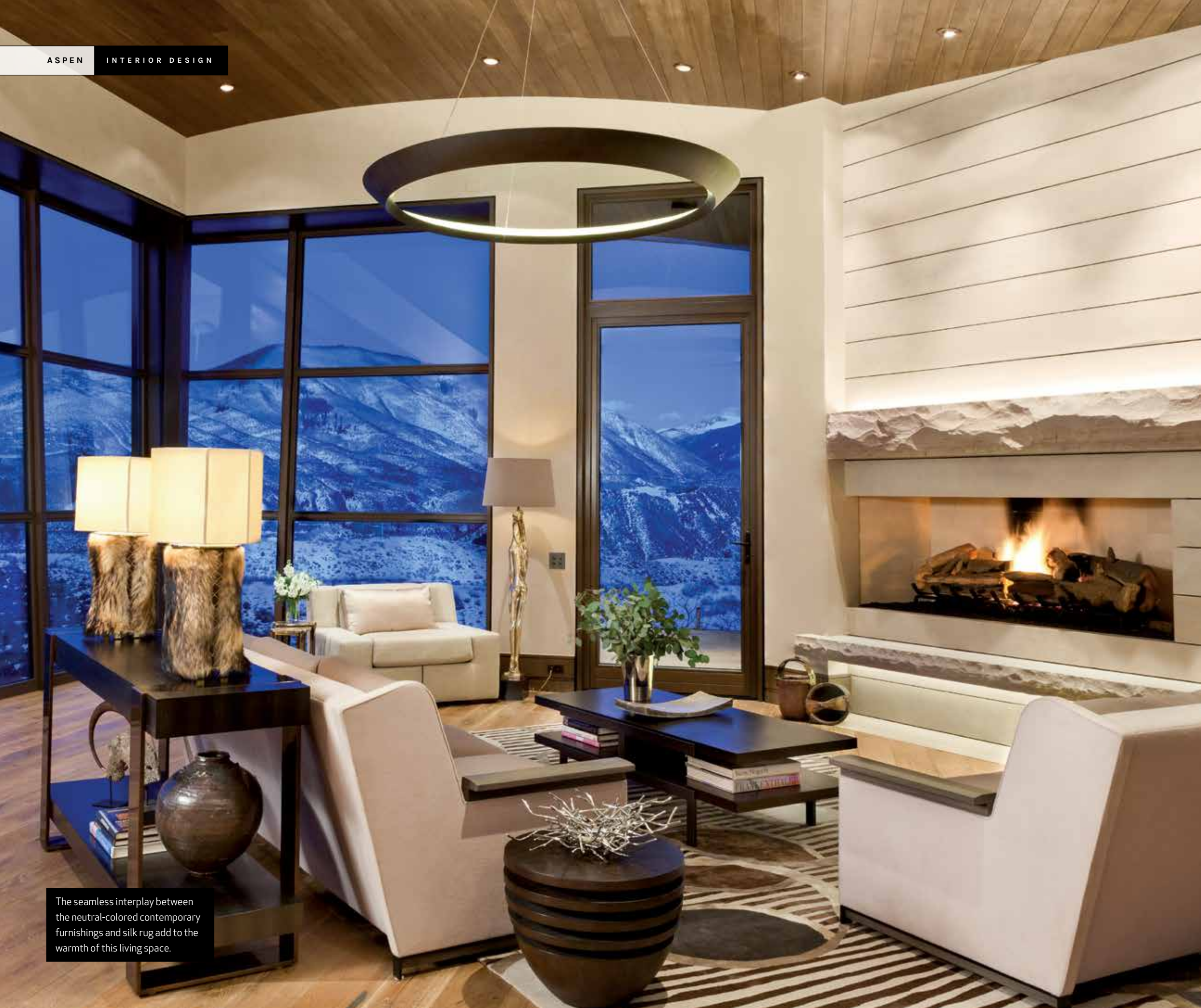
The seamless interplay between the neutral-colored contemporary furnishings and silk rug add to the warmth of this living space.